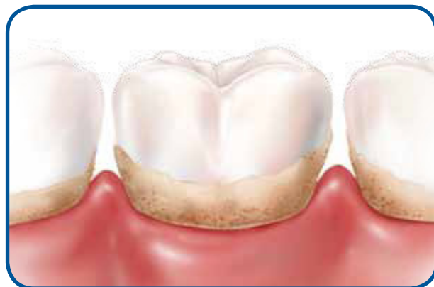
Plaque and tartar buildup