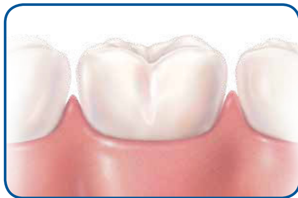
Healthy teeth and gums

The check-up should also include your tongue, throat, face, head, and neck. This is to look for any signs of trouble, swelling, or cancer.