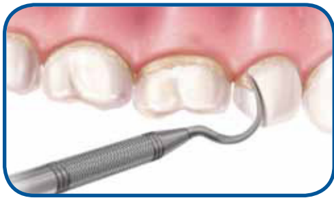
Scaling removes plaque and tartar

Brushing and flossing help clean the plaque from your teeth, but you can't remove tartar at home. During the cleaning, your dental professional will use special tools to remove tartar. This is called scaling .